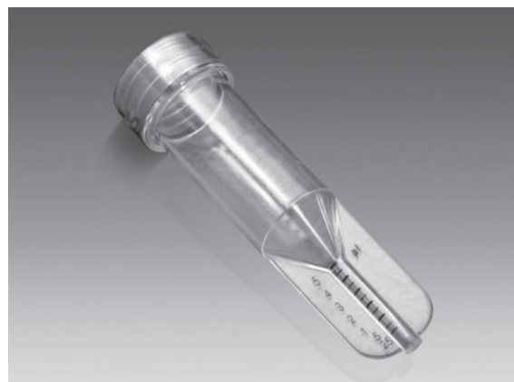
Figure 1 | VoluPAC tube for biomass determination from cell culture suspensions.

PUBLISHED ONLINE 21 SEPTEMBER 2006; DOI:10.1038/NMETH942